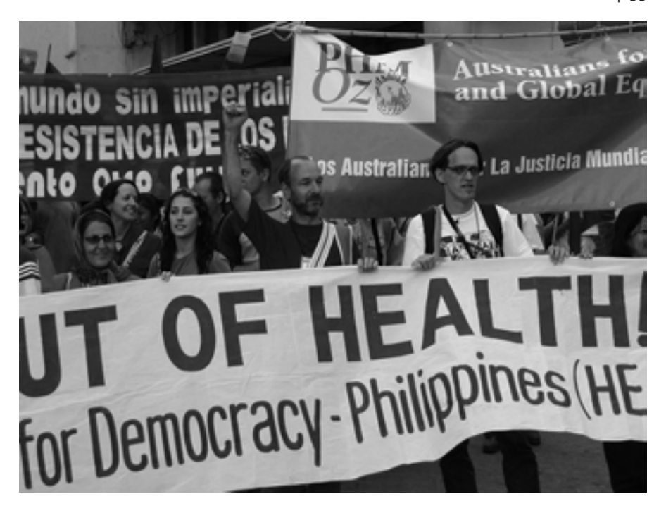
8 Rally for equity in health at Peoples Health Assembly, Cuenca, Ecuador, 2005 (David Legge)

in rural areas compared with 27.7 deaths in urban areas), with rural infant mortality declining further to 23.7 in 2003 (Mehryar et al. 2005).