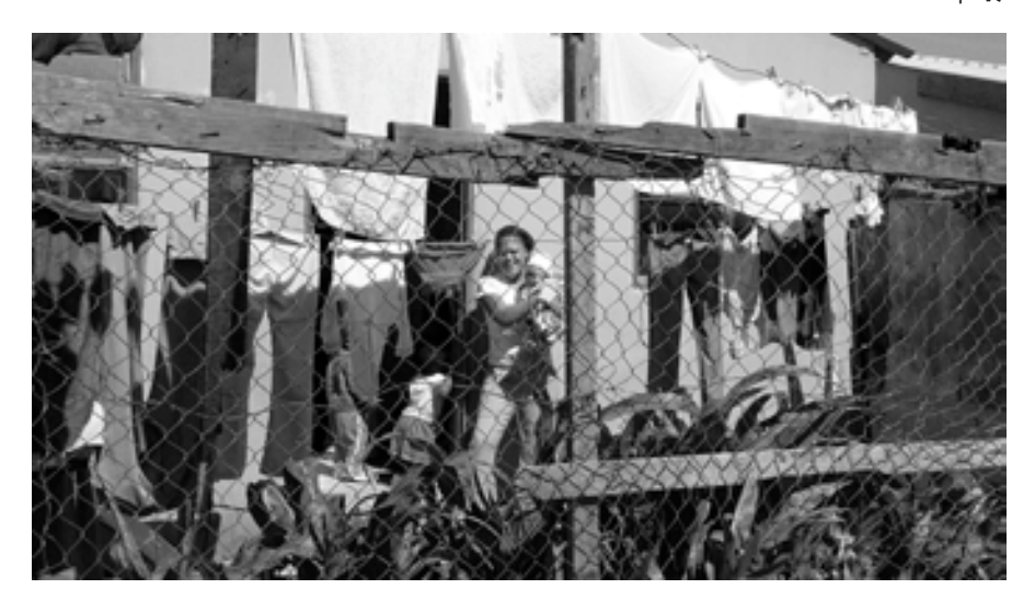
6 Woman in a shanty in Cape Town, South Africa: persisting social and economic inequity in LMICs (Louis Reynolds)