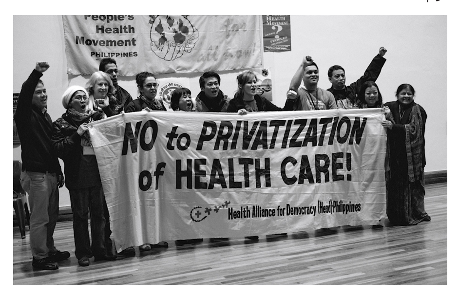
Image B1.4 Delegates at the People's Health Assembly in 2012 (Louis Reynolds)

GDP in 2012, one of the lowest rates in the world (Planning Commission of India 2013: 3). With private healthcare accounting for 80 per cent of outpatient and 60 per cent of inpatient care, India is one of the most privatized systems in the world (NSSO 2006).