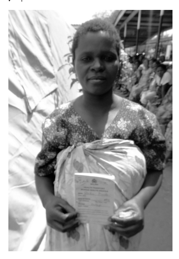
Image B1.1 A woman from Malawi with her health card: reforms in the 1980s led to crumbling health systems

network of facilities and services that are appropriately situated at primary, secondary and tertiary levels.