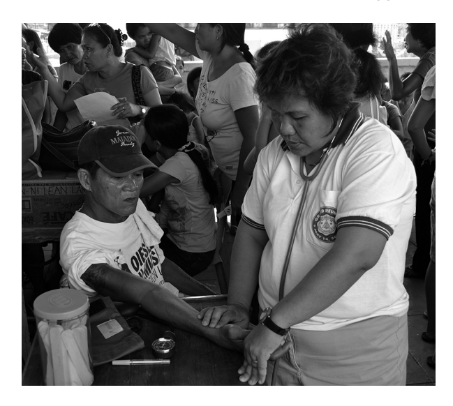
Image B1.3 A health worker in the Philippines: basic and not comprehensive public services was the message from the World Bank (Third World Health Aid)

Further, under the UHC model, governments can choose more progressive options for financing - such as tax-based funding in a progressive regime of taxation. However, in situations where the state itself is committed to pursuing neoliberal policies, such progressive options may not be adopted.