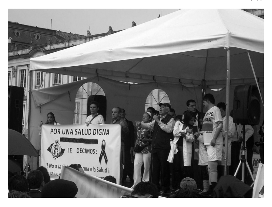
Image B1.2 Massive demonstrations against health-system reforms in Bogotá, Colombia (Mauricio Torres)