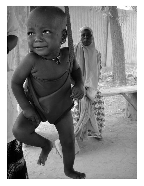
Image C<sub>3.1</sub> Growth monitoring in Niger; a quarter of all children in the world are undernourished today (David Sanders)

The means of, and the control over, the production of food are shifting from the farmers in the South to big agri-food businesses and transnational retail