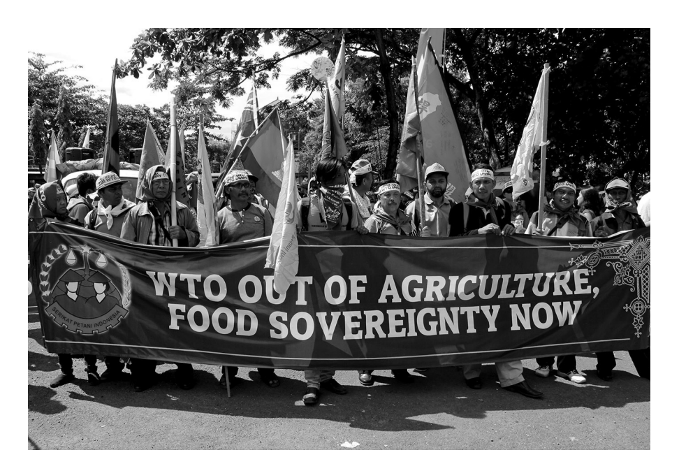
Image C3.4 The WTO agreement has a deep impact on food sovereignty in the South (Benny Kuruvilla)

Trade and the cash economy have also supported urbanization, which offers a variety of non-traditional employment opportunities, and this has consequently reduced participation in agriculture (particularly subsistence agriculture) (Thaman 1990). Some of the negative aspects of transitioning to an urban environment are the reduced land area available for planting, limited space available for traditional food storage and cooking methods (such as earth ovens), and also difficulties in transporting perishable root crops to urban communities (Parkinson 1982).