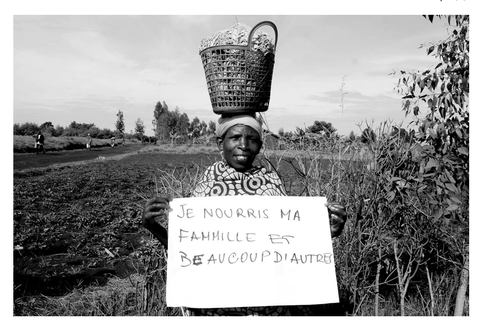
Image C3.2 'Hunger free' campaign in Burundi; control over food is shifting from farmers to agri-food businesses

companies based mainly in the North, removing power from local producers, consumers and, in many instances, policy-makers. Liberalized trade regimes, food price speculation in the global market and land grabs are contributing to this shift. The Agreements of the World Trade Organization (WTO) have moved control over the right to food and food security to the global market (Friel et al. 2013; Ghosh 2010). Human-induced climate change plus other forms of environmental degradation are also affecting the food system, contributing to the impaired quantity, quality and affordability of food in many countries (UNDP 2007).