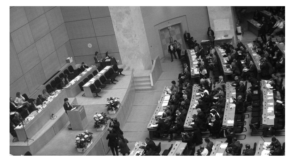
Image D1.2 The World Health Assembly in session in Geneva (Camila Guigliani)

funds, assessed and untied versus tied voluntary contributions. The former, the smaller tranche, is available to support what the WHA commits to, through its resolutions. The latter, vastly overshadowing flexible funds, is available to support what the donors want WHO to do (and by non-funding to prevent WHO from doing what they, the donors, do not support).