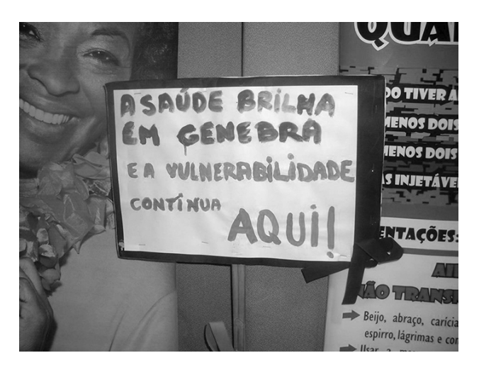
Image D1.1 Placard in Rio, Brazil – 'Health shines in Geneva, vulnerability continues here'

The current reform programme does not rate highly against these criteria. On the contrary, as we noted in GHW1 (GHW 2005), WHO is under continuing pressure to retreat to a purely technical role and to withdraw from any effective engagement with the political and economic dynamics that characterize the global health crisis. We conclude with some notes on civil society advocacy for the WHO that we need.