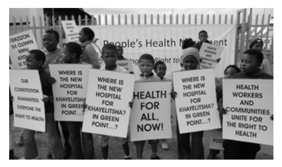
50 Right to Health campaign in South Africa (Louis Reynold)

In the last four years, the campaign has advanced significantly with RTH activities under way in the Democratic Republic of Congo, Congo, Benin, Burkina Faso, Mali, Togo, Gabon, Cameroon, Senegal, South Africa, Zimbabwe, Kenya, Morocco, Uruguay, Guatemala, Bolivia, the UK and India. Eleven of these countries have already finalised assessments reports on the Right to Health. New PHM circles have been formed in several countries that have joined the campaign. A case study of the campaign in Guatemala is briefly mentioned as an example.