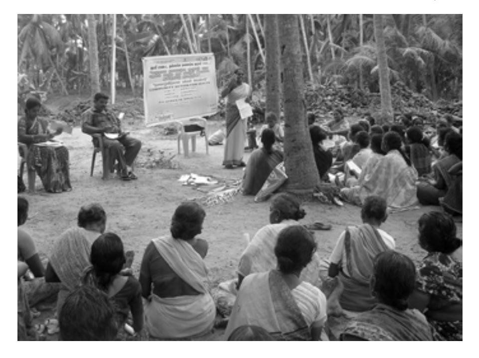
48 Community based monitoring of health services, India

In parallel with this, advocacy was carried out by certain PHM-India-associated activists to provide an institutional form for the health rights campaign. Carrying this forward, and based on coordination by the NRHM Advisory Group for Community Action, from 2007 onwards an innovative process of 'community-based monitoring of health services' (CBM) was developed; in the pilot phase during mid 2007 to early 2009 this was implemented in 35 districts of nine states. PHM-India member organisations have anchored this activity in certain states. Although this is a broad, publicly organised and funded activity, groups and individuals associated with PHM-India continue to play a key facilitating role in this process in certain states.