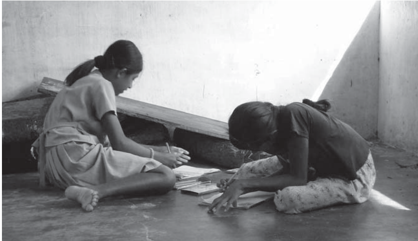
IMAGE C8.2 Students in Sri Lanka