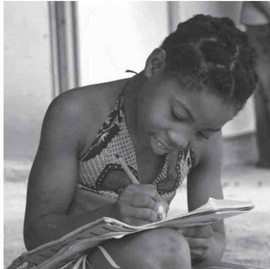
IMAGE C8.1 Schoolgirl in Mozambique

and politicised response by civil society actors to promote and support citizens' claim-making.